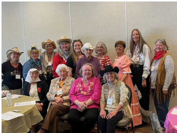
Zeta Chapter celebrates Founders’ Day with a Wild West Hoedown